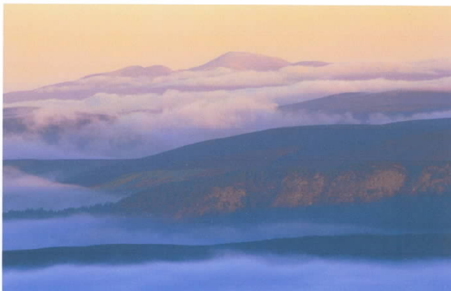
Ben Kilbreck at Dawn - part of the Sutherland Partnership Biodiversity Collection which is available for use by community groups for non profit making purposes.

For more information on any of the items in this newsletter please contact us: